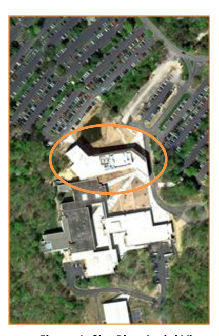
Figure 1: Site Plan Aerial View

Overall, limiting factors on the STEM Center design were minimal. With the site being on the DCCC Marple Campus, in the greater Philadelphia area, it was obvious that there would be a slightly higher emphasis on heating than cooling, but a need for good balance and control altogether. The building design and architecture itself, containing a sizeable glass façade on south side at all four levels, suggested a concern for high amount of solar gain as well. The orientation of the building is suitable though, as the majority of the glazing won't receive the significant glare they might if facing east or west.