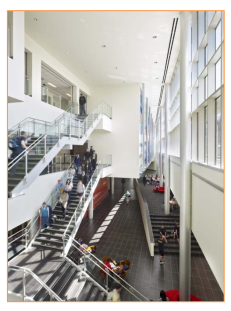
Figure 3: View of Lobby and Glazing

The building orientation is ideal for passive solar design, as it is elongated east to west, has the curtain wall on the south façade, and has more important and higher occupied spaces on the south side. It is also good to maintain the daylight achieved by the glazing while harnessing the heat it provides as well. This can be accomplished through a few different methods: direct gain, indirect gain, and isolated gain. For the STEM Center, it would be most appropriate to not use